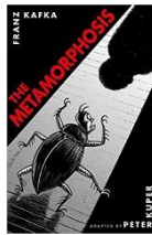
The Metamorphosis (a PDF version is available online)